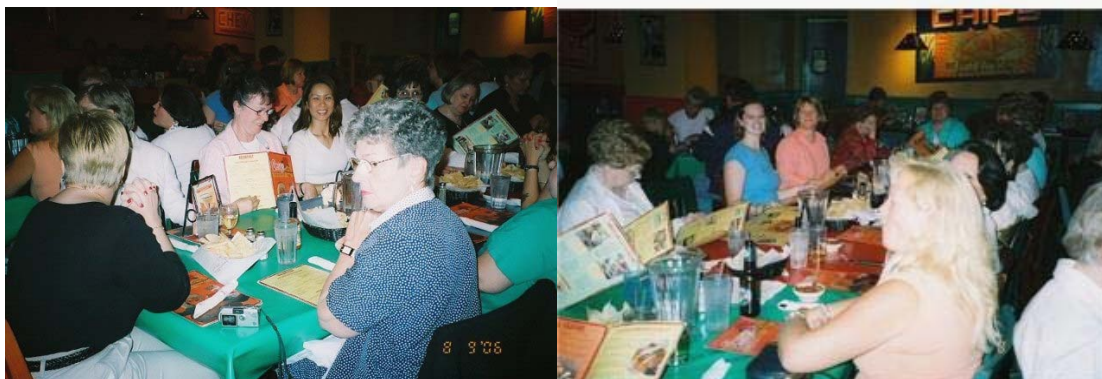
MN-ND-SD Division Get Together in Reno