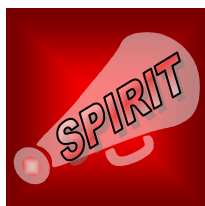
Spreading Passion, Inspiration, Reliability, Innovation, Trust MN-ND-SD Division 2006 - 2007

S preeding P assion I nspiration R eliability I nnovation T rust!